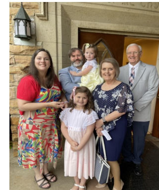
A Special Easter Celebration at DUMC